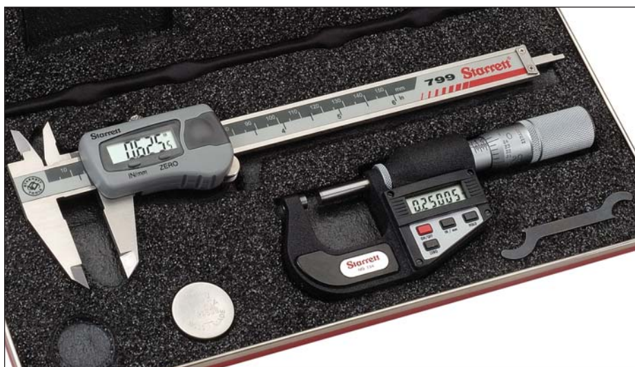
Inch Set (without output) No. S766AZ / EDP 12206