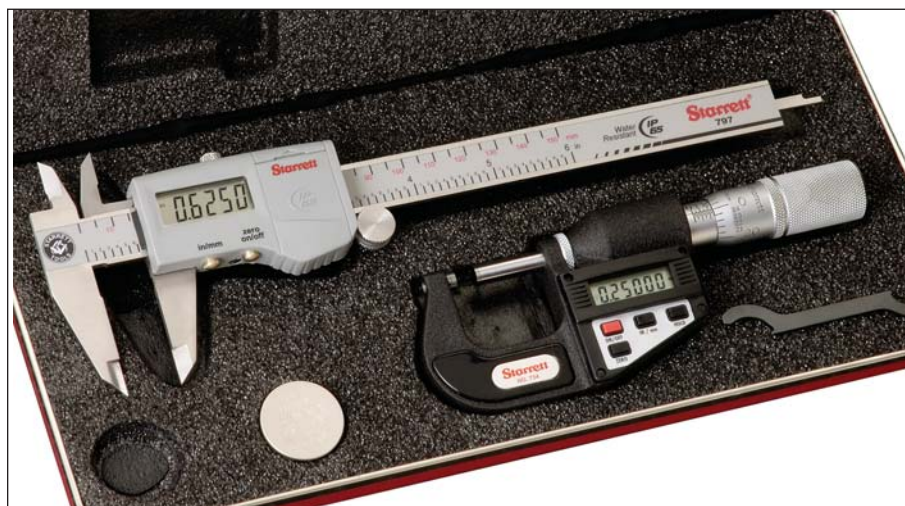
Inch Set (with output) No. S766BZ / EDP No. 11606

Basic starter sets for electronic measuring with output capability for SPC. They include slide calipers and 1"/25mm micrometers. Two sets are offered – sets No. S766BZ and No. S766MBZ. Both sets include an attractive, protective case.