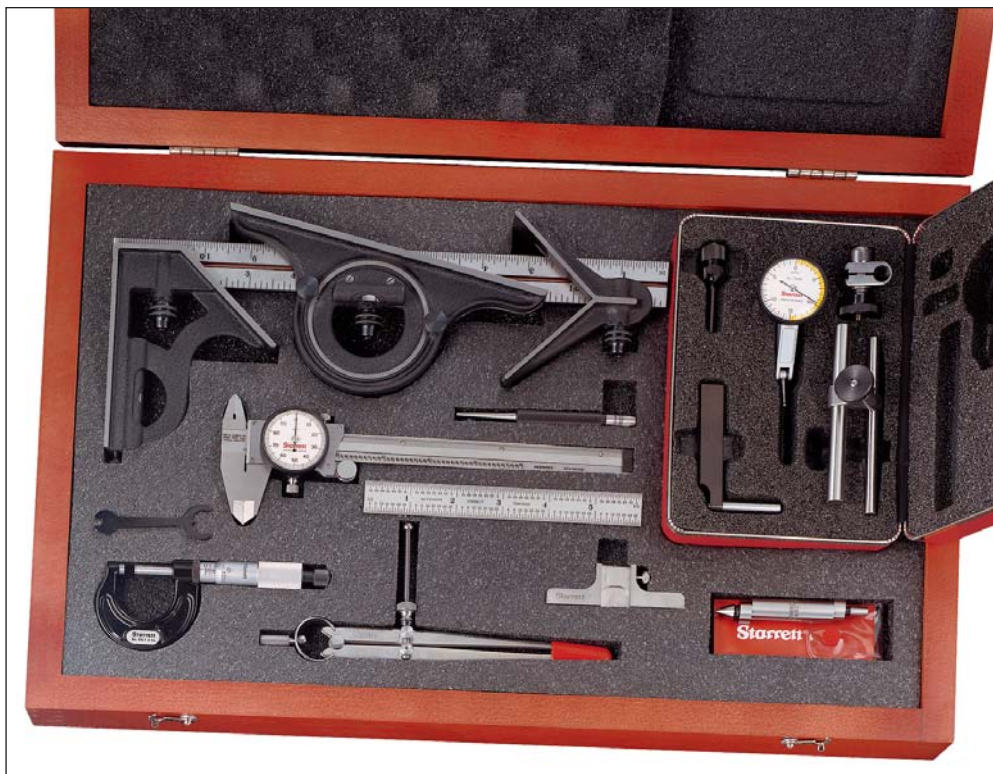
Inch Set No. S908Z / EDP 65120

Mix of the precision tools required by toolmakers to perform typical layout and measuring work for many tool and die applications. Furnished in attractive, protective cases.